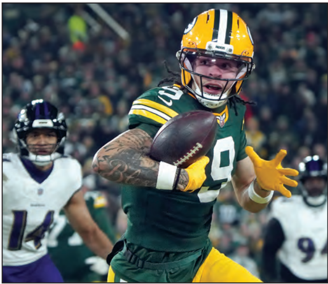
In a loss to the Baltimore Ravens, Christian Watson recorded a season-high 113 receiving yards and a 39-yard touchdown.