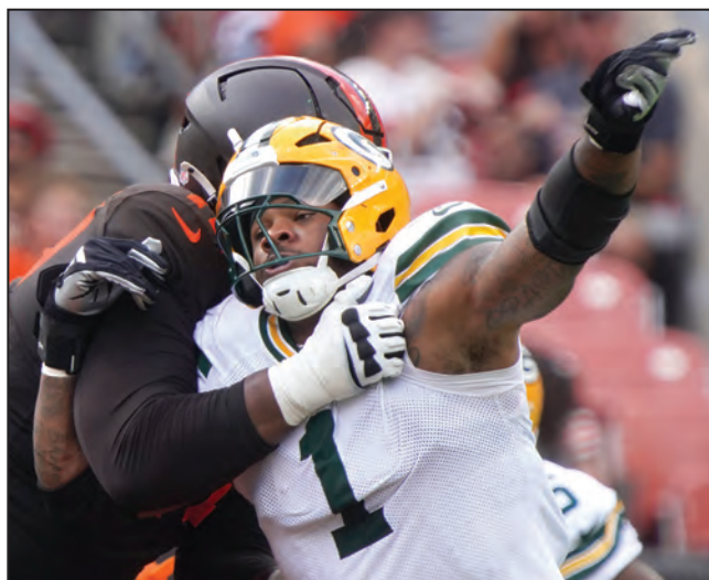
On Aug. 28, 2025, the Green Bay Packers acquired All-Pro edge rusher Micah Parsons from the Dallas Cowboys in a monumental trade, making him the highest-paid non-quarterback in NFL history at the time.

Don't be surprised if any of Green Bay's pending unrestricted free agents like Walker, Romeo Doubs and Rasheed Walker all end up playing elsewhere in 2026.