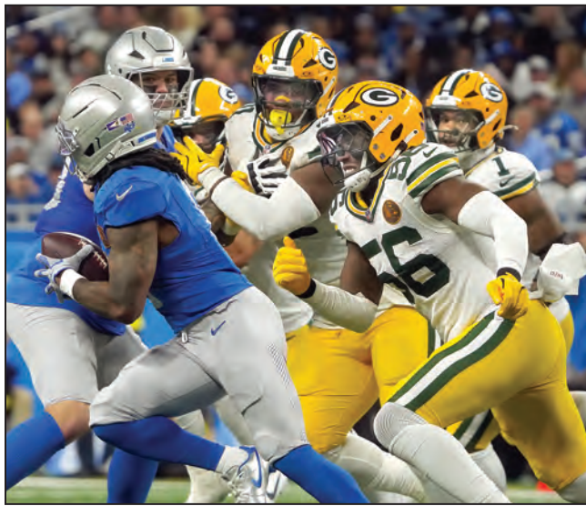
Defense delivered a dominant performance against the Detroit Lions during the 2025 season, winning both regular-season matchups, the unit stifled Detroit's high-powered run game.