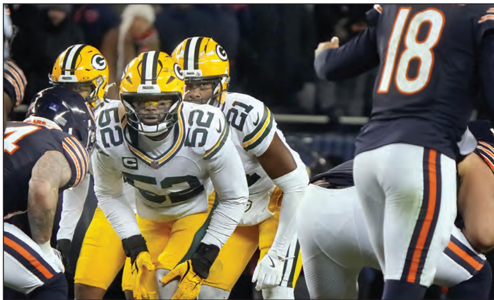
Nate Hobbs and Rashan Gary failed to live up to high expectations and significant financial investments.

Rasheed Walker came to Green Bay as a seventh-round selection in 2022 and has started 48 games protecting quarterback Jordan Love's blindside. Walker has had an up-and-down career so far, as he has proved much better in