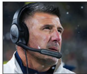
Mike Vrabel, now coaching New England, was the leader of the Tennessee Titans in 2023.

Darnold more than proved that to be true, as he finished the season with 4,048 passing yards and 25 passing touchdowns, while becoming just the