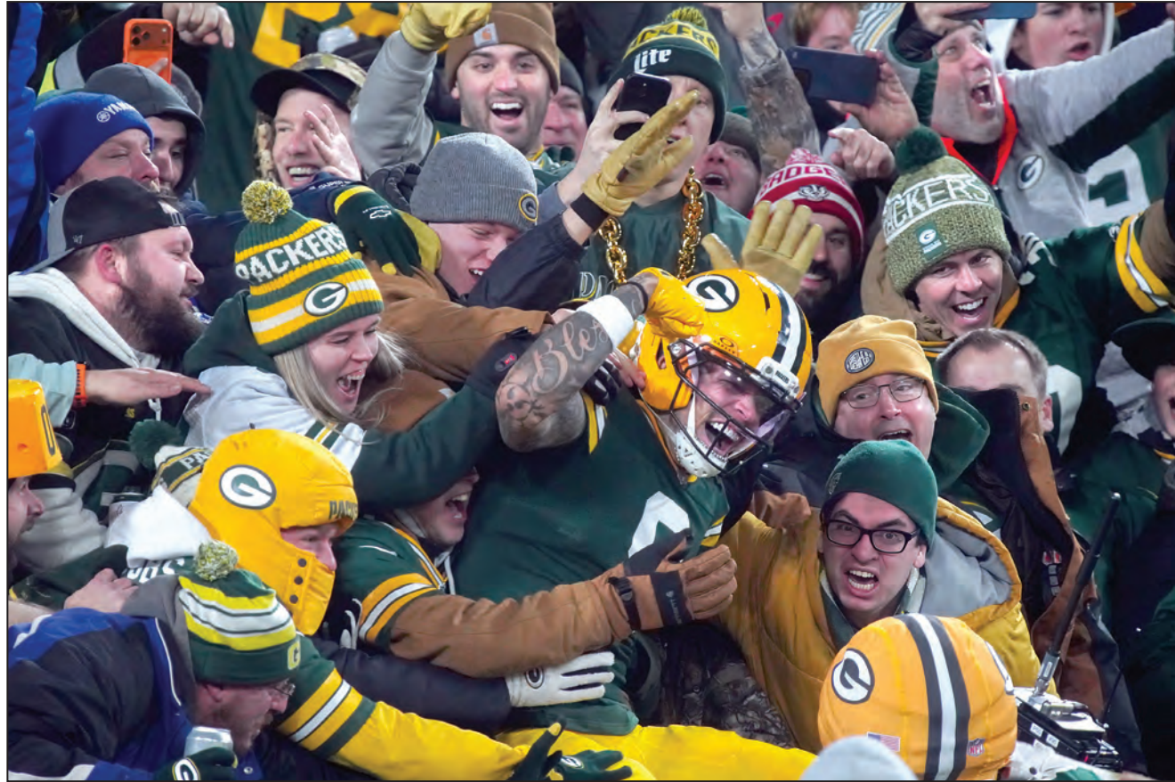
Christian Watson returned from a ACL injury, finishing with 35 receptions for 611 yards and six touchdowns in 10 games. Watson celebrates a TD abasing the Ravens.