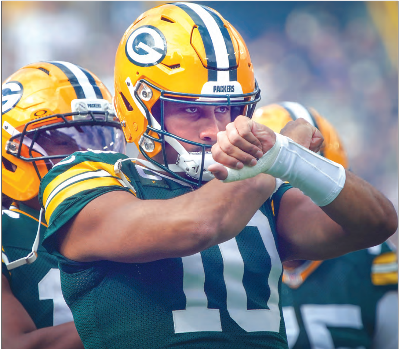
Jordan Love had a strong year, leading the team to the playoffs with a solid statistical performance, including 23 touchdowns, six interceptions, more than 3,300 passing yards and a high passer rating.