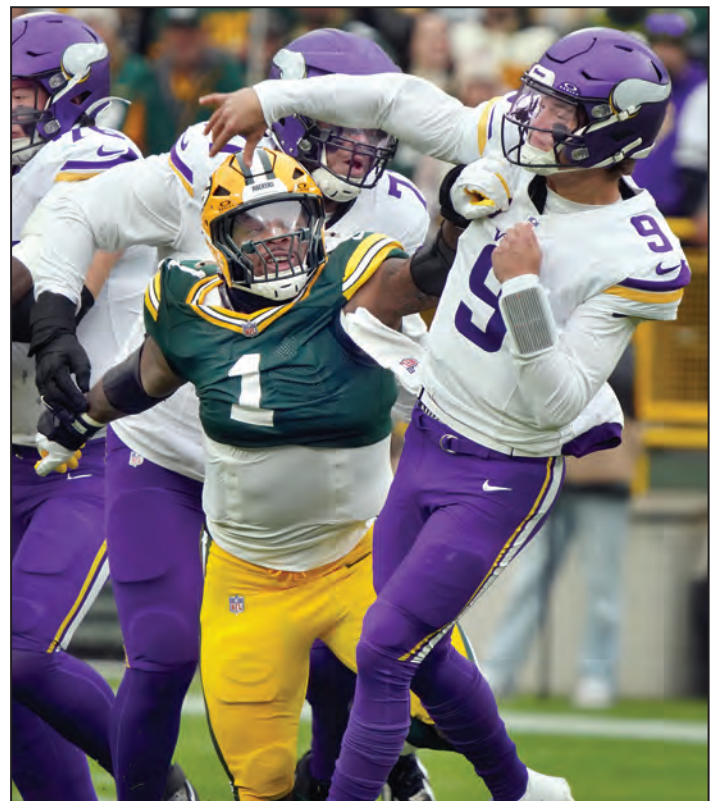
Micah Parsons established himself as a dominant force for the Green Bay Packers after a high-profile trade, earning first-team All-Pro honors for the third time and a fifth straight Pro Bowl selection despite a season-ending ACL injury in Week 15.

the regular season, Love said that this matchup against the team's biggest rival are the moments that players get up for.