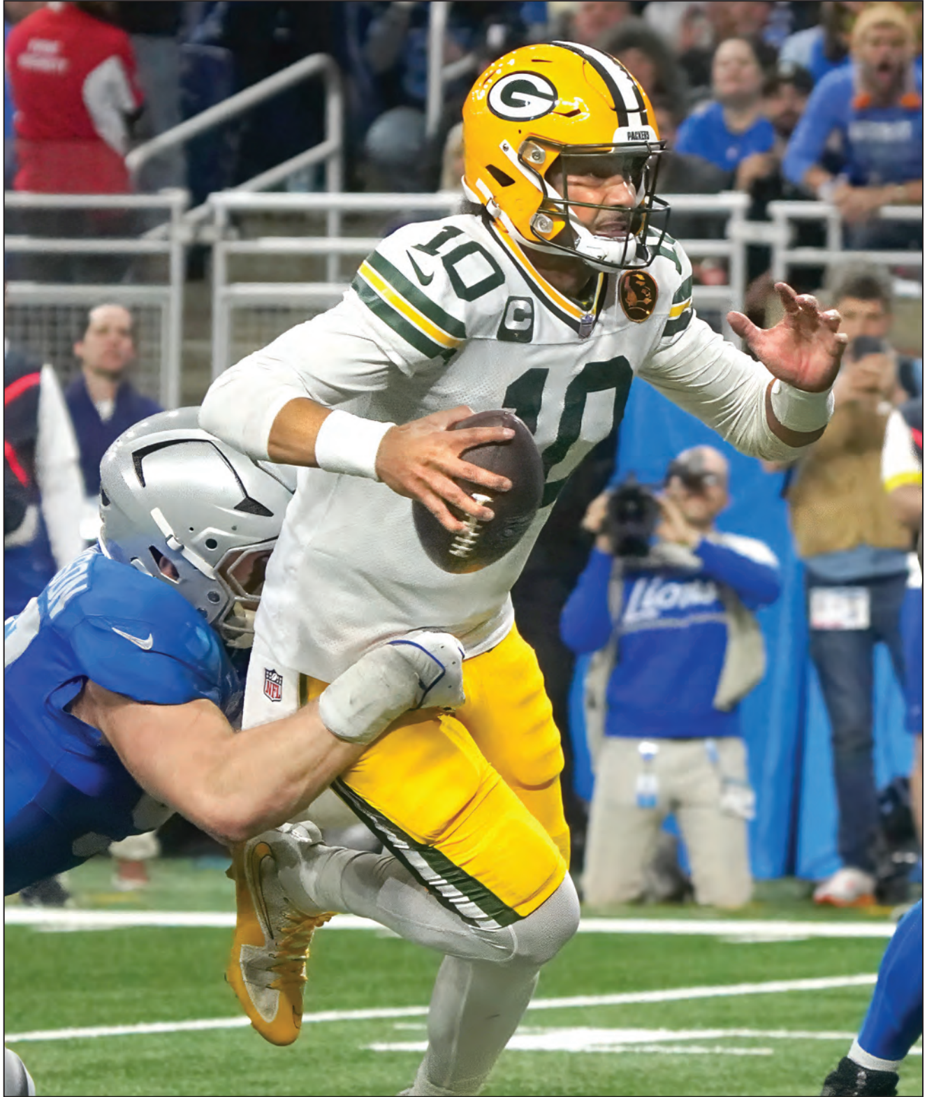
Jordan Love led the team to two victories over the defending NFC North Champion Detroit Lions. His performance in Detroit earned him the Madden Thanksgiving Day MVP following a 31-24 win.

The Packers went into the game favored, which may seem odd, but given that the Packers outplayed Chicago for seven out of the eight previous quarters it made sense. Even with the disappointing end to