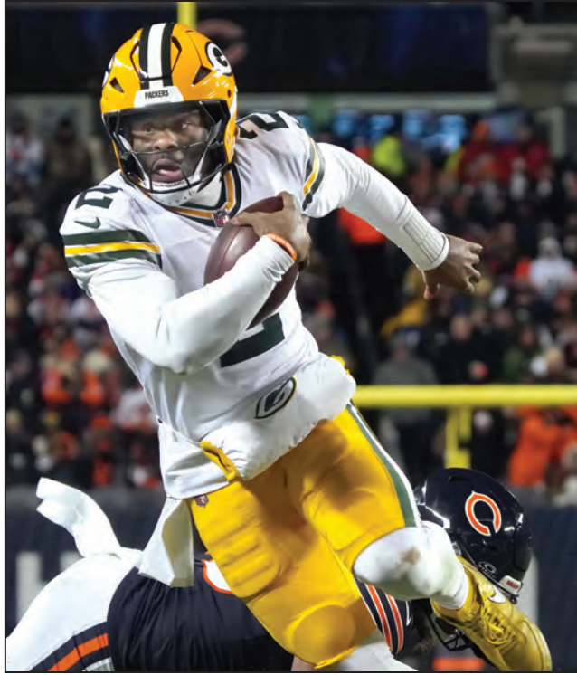
Malik Willis in four games completed 30-of-35 passes (85.7%) for 422 yards, three touchdowns and no interceptions, finishing with a nearly perfect 145.5 passer rating.