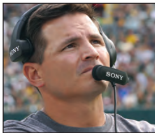
Seattle coach Mike Macdonald stands on the sidelines at Lambeau Field in August 2025.

For Seattle, the story of its offseason was moving on from quarterback Geno Smith and bringing in Sam Darnold, who Minnesota had let go in favor of the younger J.J. McCarthy. Even though Darnold won 14 games with the Vikings last season, the jury was still out on if he could be